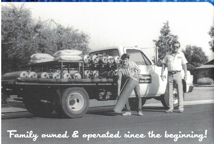
Family owned & operated since the beginning!